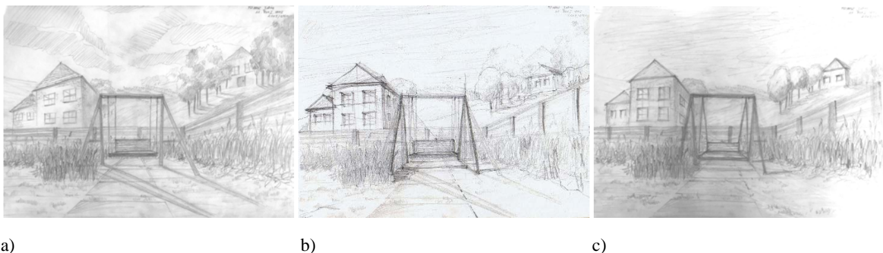
Figure 2: Subject of the drawing: the perspective of the own project (Author: T. Jaróg); a) before; b) teacher's corrections; and c) after, 2020 (from the CUT Archive).